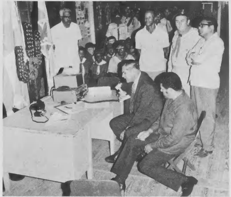
Communications Minister Leo Chance inaugurates the World Jamboree on the Air by making the first overseas call from Oranjestad. Ministro di Comunicacion Leo Chance ta inaugura e Jamboree Mundial den Aire door di haci e promer yamada na Oranjestad.